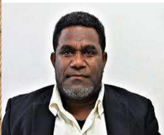
Hon. Minister Johnny Koanapo

The collective efforts of all those mentioned above have been pivotal in the development of the National Labour Mobility Policy review and Action Plan. Again, their support and contributions have been instrumental in shaping the Policy and we are most appreciative for their invaluable assistance.