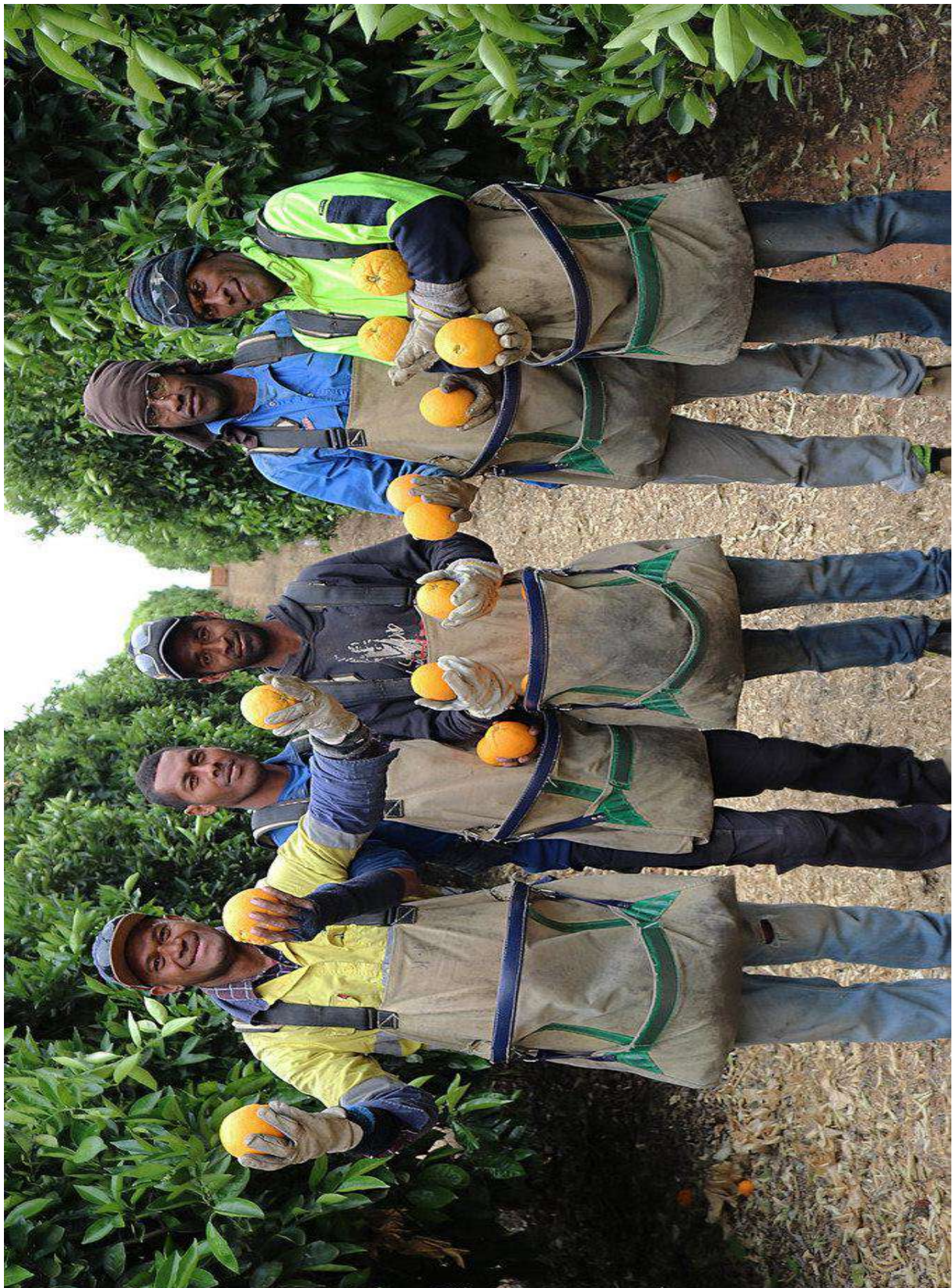
Pacific Australia labour mobility scheme