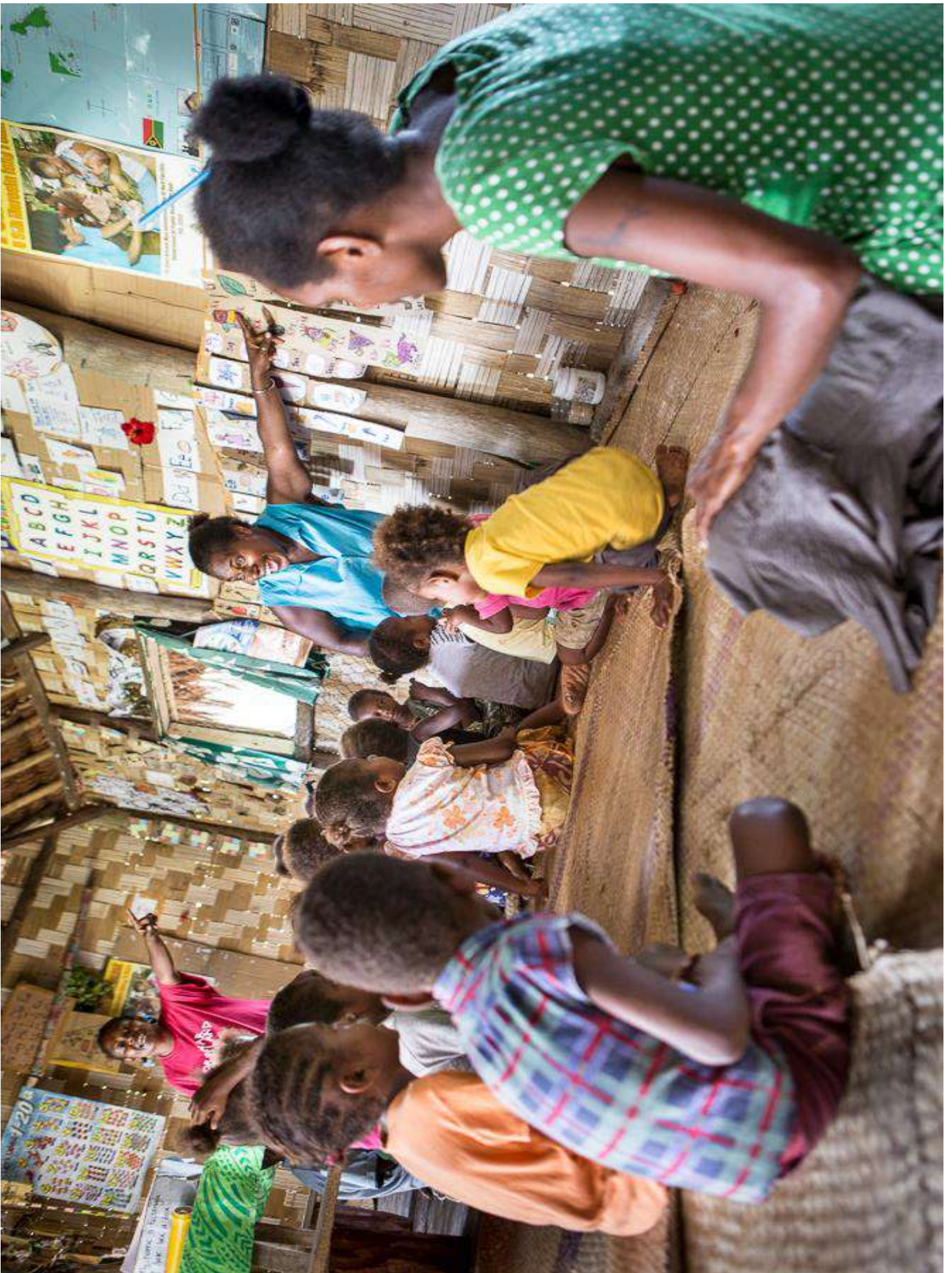
Pacific Australia labour mobility scheme