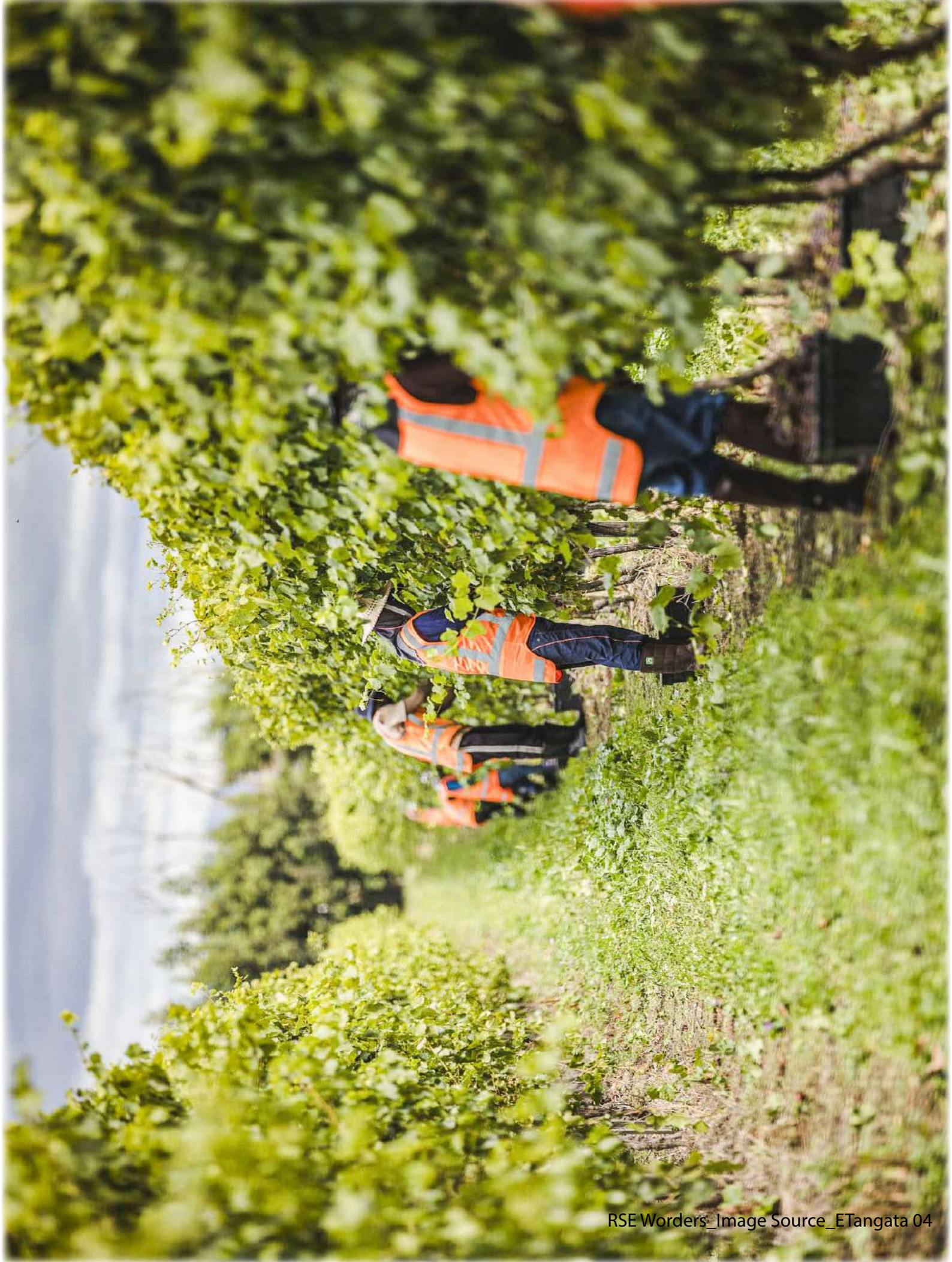
RSE Worders_Image Source_ETangata 04