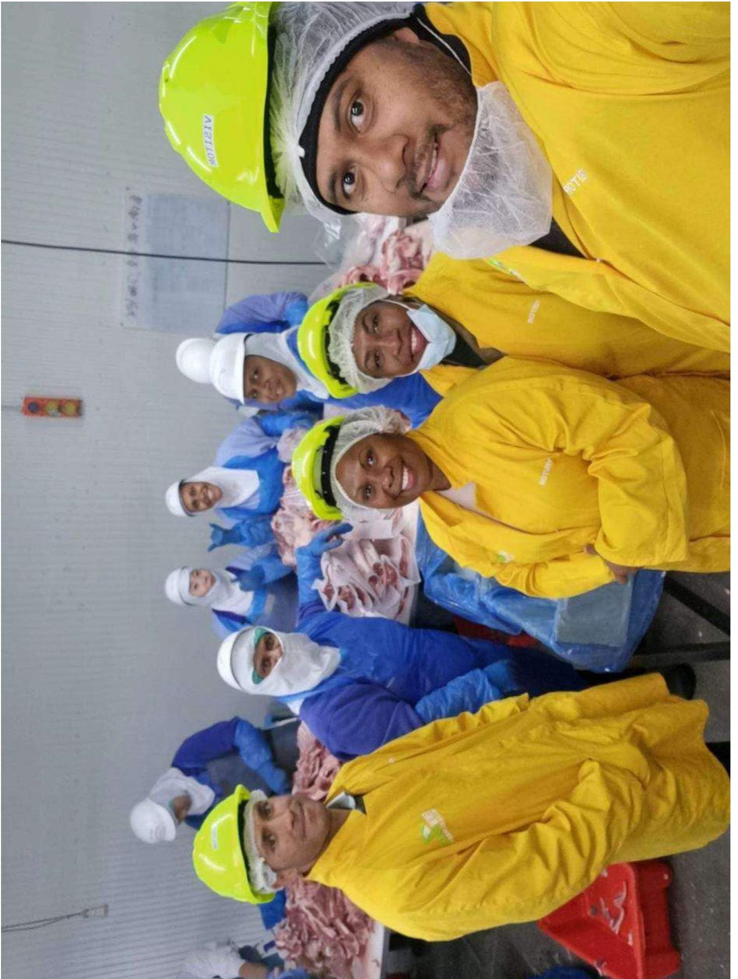
Pacific Australia labour mobility scheme